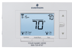
Emerson 80 Series™