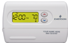
Classic 80 Series™