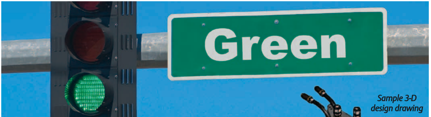
Sample 3-D design drawing

The panel is used to control the supply pressure of CNG to the engine of buses or trucks. It incorporates a pre-filter, pressure regulator with integral relief valve, downstream solenoid valve for remote shut-down of the system.