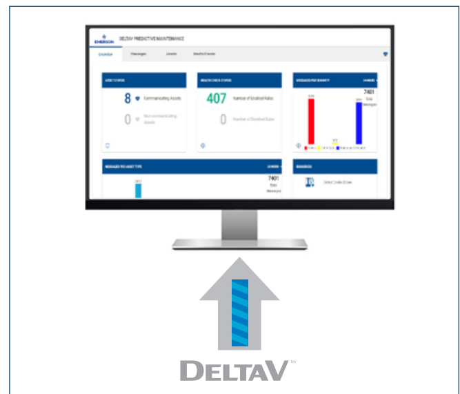
The DeltaV Predictive Maintenance process.

Online monitoring of critical system assets: Hundreds of health checks are repeatedly and automatically performed on control system assets such as controllers, DCS servers and workstations, SIS controllers, switches, firewalls, DeltaV Virtualization infrastructure, CIOCs, UPSs, and non-DCS servers and workstations.