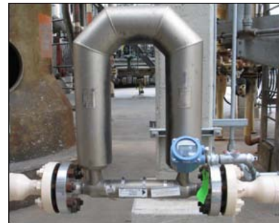
Installed Micro Motion® ELITE® Series flowmeter

In another part of the refinery, they were already using Micro Motion Coriolis meters for hydrogen measurement. In that part of the