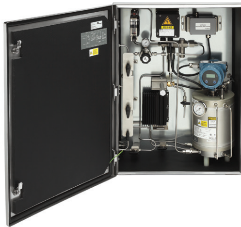
Micro Motion Specific Gravity Meter with Sample Conditioning System

This meter provided the molecular weight and specific gravity measurements, independent of process conditions. The meter enabled them to more accurately determine the surge limit, and operate with increased efficiency and reduced risk of damage due to surge.