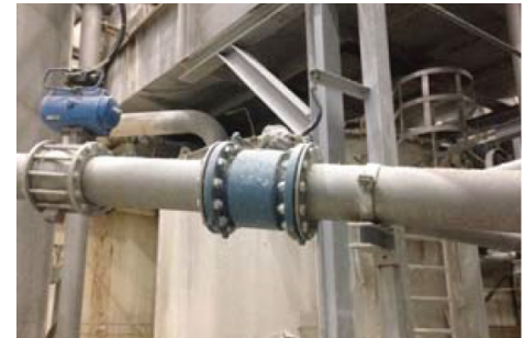
Rosemount 8705 Magnetic Flowmeter installed in the most critical section of continuous machine feeding.