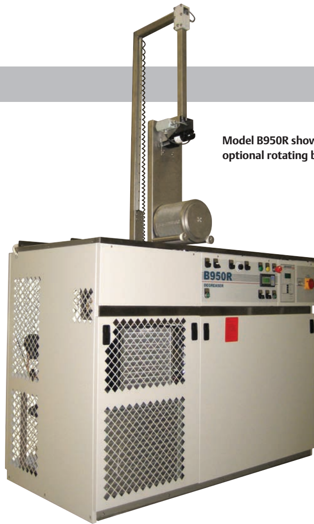
Model B950R shown with optional rotating basket