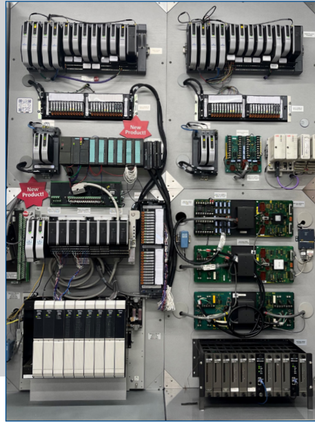
Solutions for ABB Bailey and Siemens Systems.