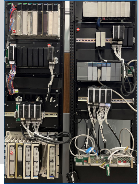
Wiring Solutions for Rockwell and Schneider Modicon™ PLCs.