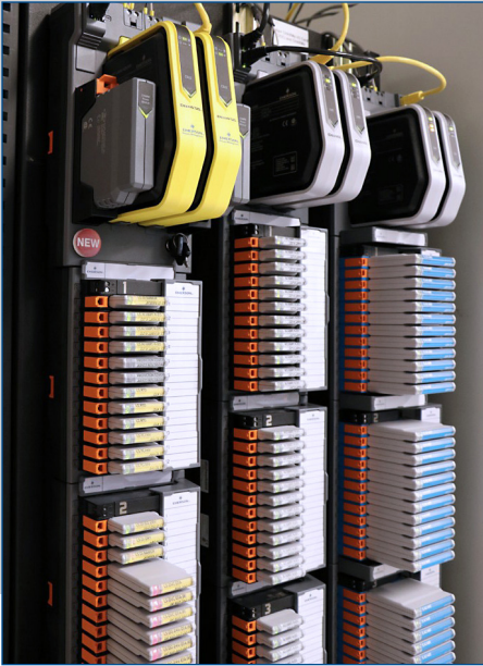
DeltaV Electronic Marshalling.