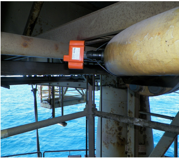
Figure 3. Permasense ET210 wireless ultrasonic wall thickness sensors provide continuous corrosion monitoring of jetty pipelines.

Jetties can often be several hundred feet long, with multiple berths and the capability to handle many different products simultaneously. To accommodate the various oil products and feedstocks, multiple product lines are run from shore in pipelines above and below the jetty.