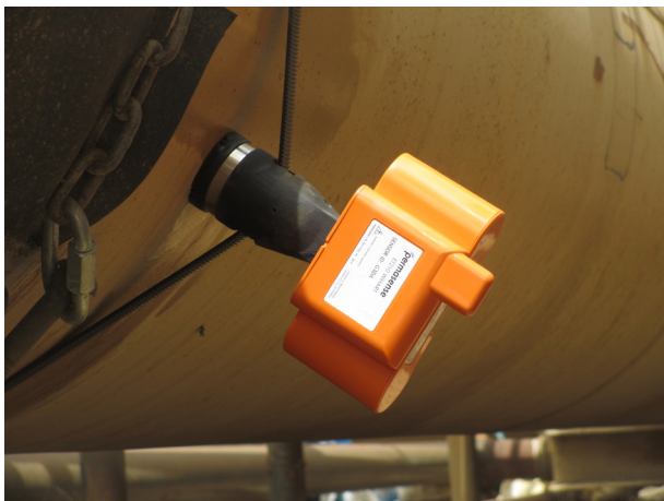
Figure 5. Installing Permasense ultrasonic corrosion sensors is a simple matter. Approximately 25 sensors can be installed in one day per installation technician.

The installation and commissioning procedure can be completed in just a few minutes, without the need for multiple installation trade specialists (mechanical, instrument/electrical, welding, etc.). A complete monitoring system for a jetty with 25 or more sensors can be installed, commissioned and transmitting data within one day. This simple installation procedure provides advantages, particularly when working in the inaccessible locations or outside in extreme ambient conditions often found near jetties.