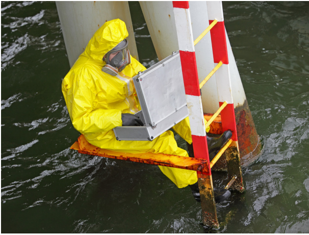
Figure 2. Suspended pipelines are difficult to inspect with manual ultrasonic methods, requiring access by boat or a ladder.