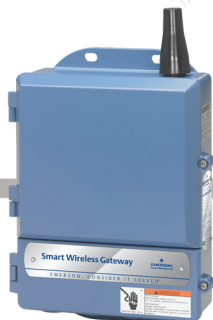
Smart Wireless Gateway