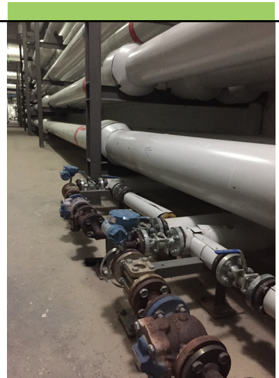
Rosemount 708 Wireless Acoustic Transmitter installation

in Linkedin.com/company/Emerson-Process-Management t Twitter.com/Rosemount_News f Facebook.com/Rosemount y Youtube.com/user/RosemountMeasurement g Google.com/+RosemountMeasurement