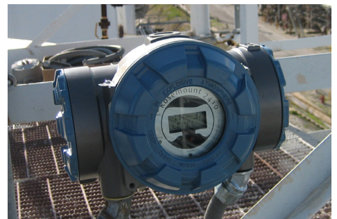
Rosemount 2410 Tank Hub.