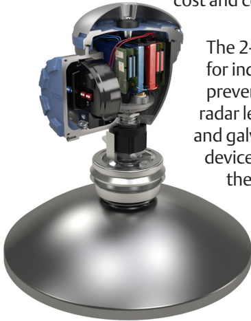
Rosemount 5900 2-in-1: Two radar units share the same antenna and enclosure.

The 2-in-1 radar level gauge was the ideal solution for this terminal. It contains two independent radar units in the same enclosure sharing a single antenna and tank connection. The 8-in. pipe could therefore be used for both level and hi-alarm measurements. No tank modifications were required and therefore the installation cost was considerably lower than initially expected. Installing and wiring a single device rather than two separate ones also reduced cost and complexity.