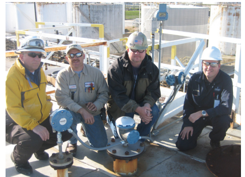
Rosemount Tank Gauging System on tank TK3740.

The 2-in-1 radar gauge reduces installation and maintenance cost considerably.