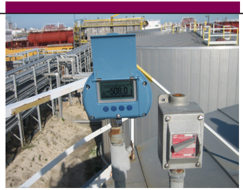
Rosemount 2230 Graphical Field Display.