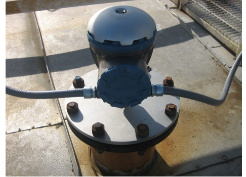
Rosemount 5900S Radar Level Gauge.